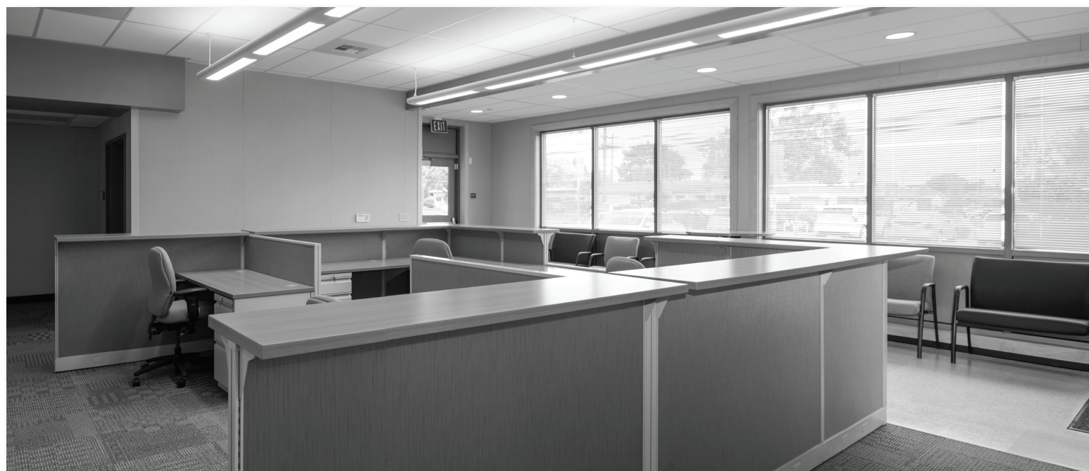
Educational Options Administration Building