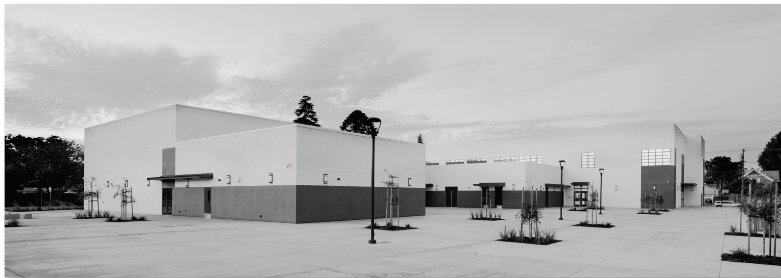
Buchser Middle School Multipurpose Room and Two-story Building

Work is now complete in the new administration building on our Educational Options campus. The project was specifically designed for the wide-ranging programs and services provided by Educational Options, including Adult Education and Wilson High School. Work continues on signage and drainage improvements.